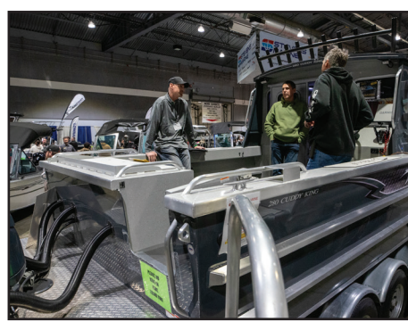
Boats, rods, ammo, apparel, guide trips, ATV's and much, much more. The Pacific Northwest Sportsmen's Show is the top retail sportsmen's show in the country. It's where people come to shop and buy!

For more information, contact O'LOUGHLIN TRADE SHOWS® 503-246-8291 800-343-6973 U.S. ONLY Fax 503-246-1066