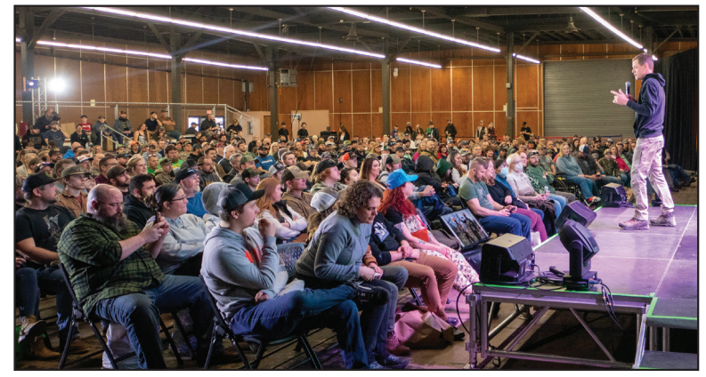
The Sportsmen's Show's seminar series and evening special events are legendary, attracting the top national and regional names in fishing and hunting that draw standing-room-only audiences.