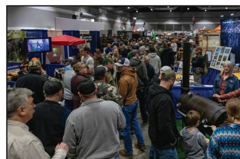
This Is The Big One!® The Pacific Northwest Sportsmen's Show is the largest Sportsmen's Show West of the Mississippi with crowds of consumers every day of the show.

Purple Booth Numbers Mean Last In, First Out